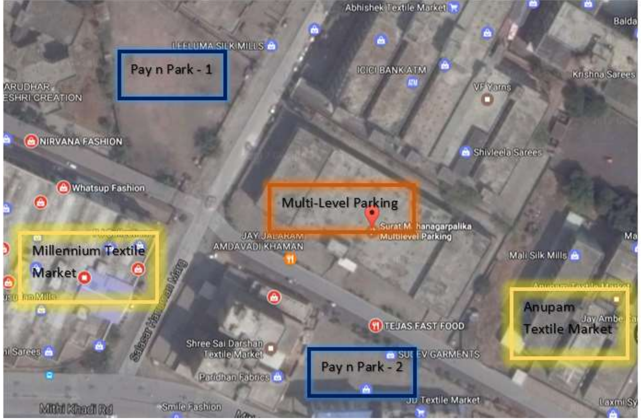
Figure 1-Site Map