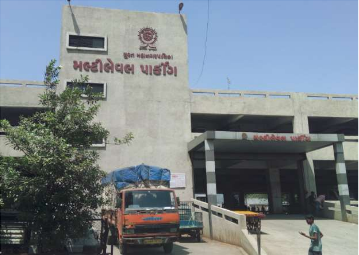
Ground Floor commercial vehicle entrance and exit