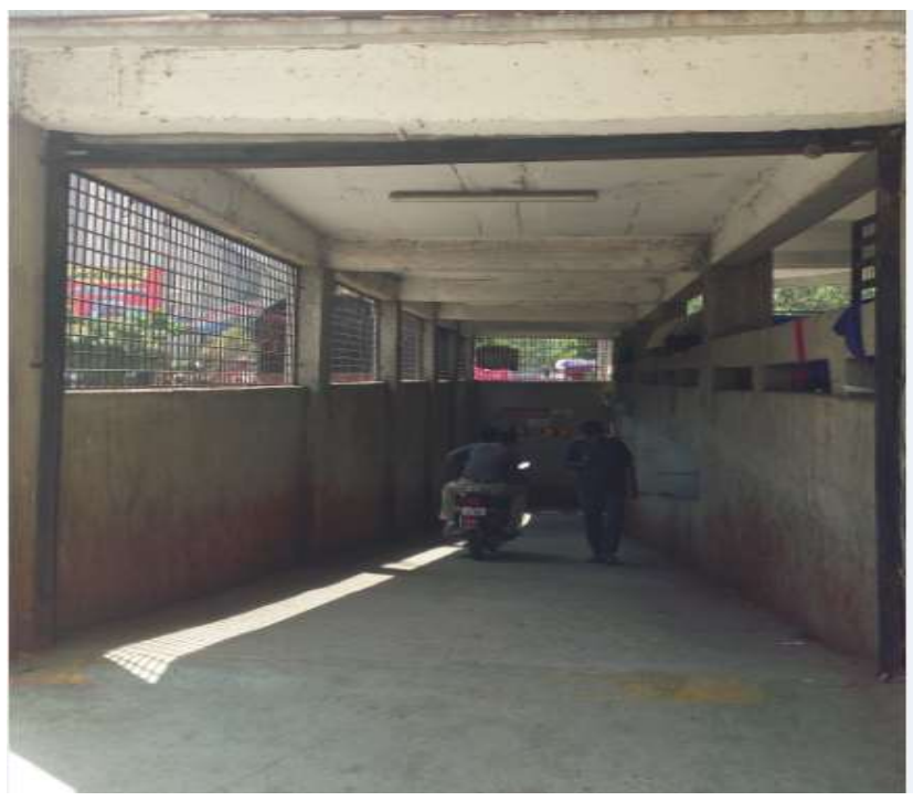
Basement 2 wheeler parking entrance