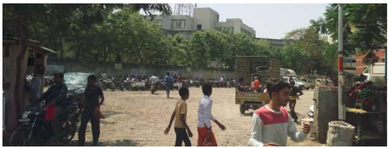
Off Street Pay n Park – 1