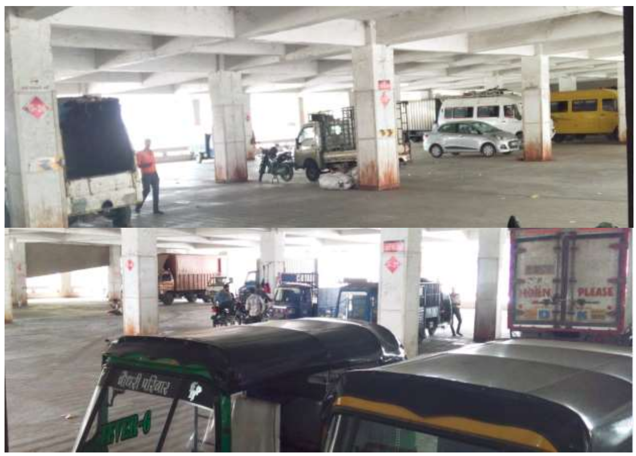
Ground Floor commercial vehicle parking