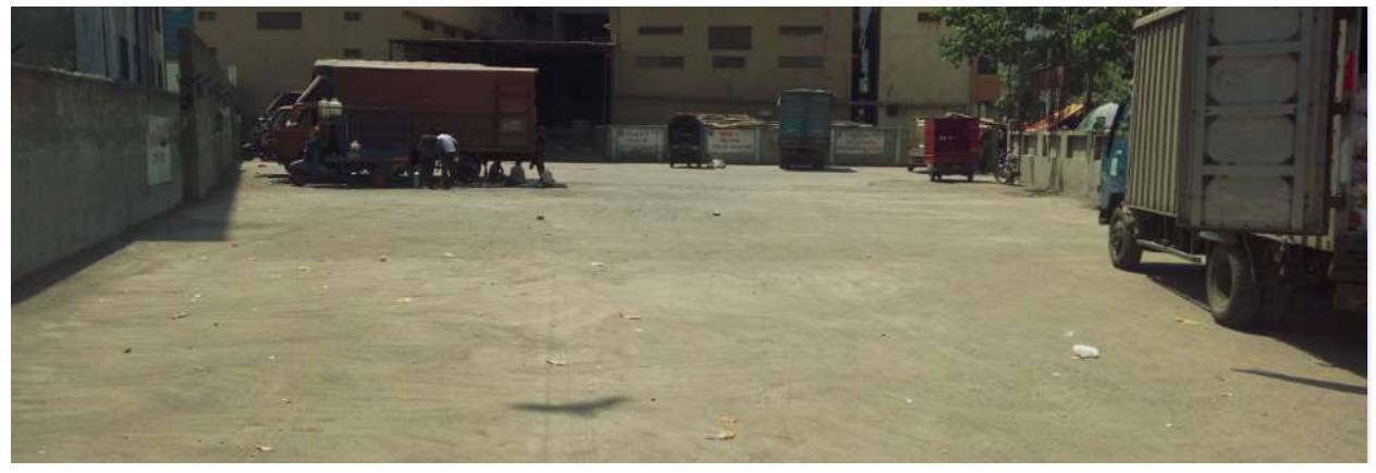
Off Street Pay n Park - 2